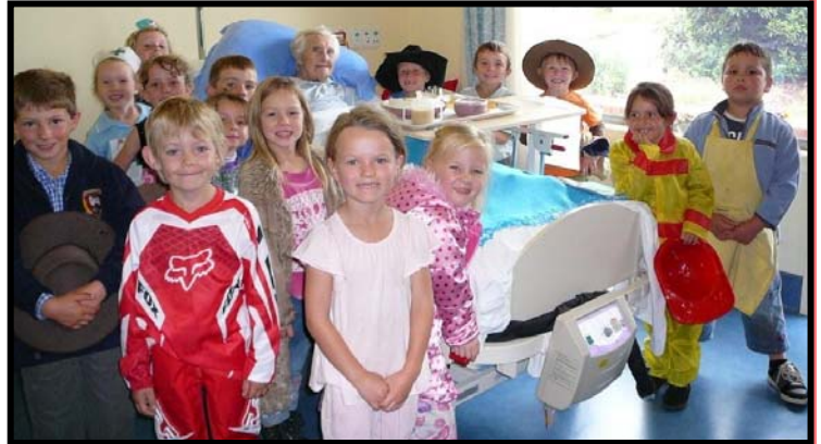
Kinder children at the Hospital visit last week!!