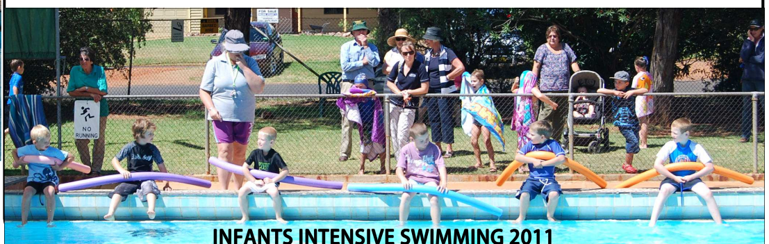
INFANTS INTENSIVE SWIMMING 2011