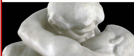
Auguste Rodin "The Kiss" - 1901-1904